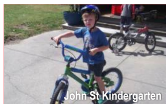
John St Kindergarten